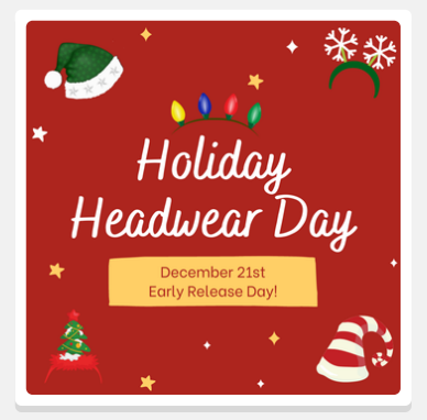
Spirit Week at Herbert Akins Rd MS